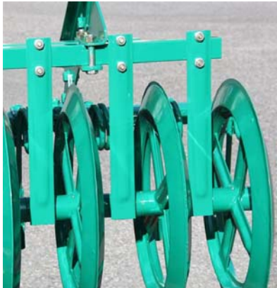
New scrapers :